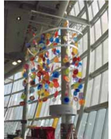
Artwork at Sprint Center Arena provided by KU Medical Center.